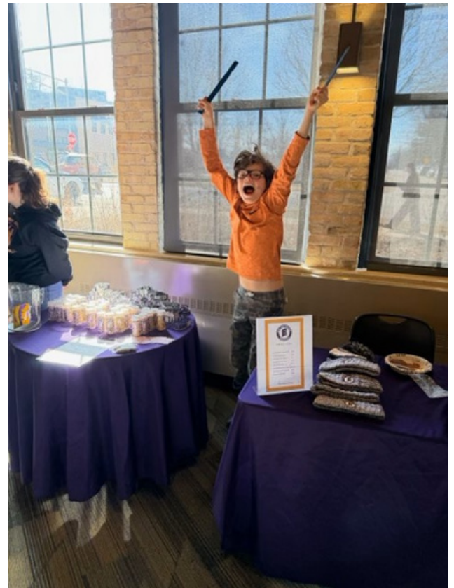
Celebrating a winning pull in the Bakeoff cake raffle