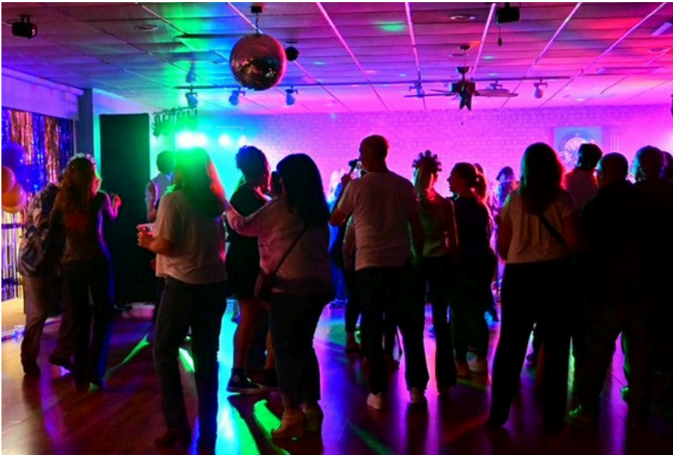
The packed dance floor at Party For Purgolders